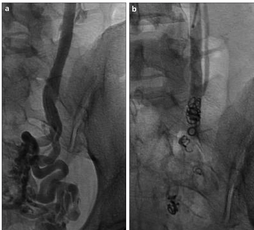
Figure 2. a, b. Venograms of Case 2 before (a) and after (b) embolization with steel coils. The left ovarian vein was dilated up to 11 mm and very tortuous (a). The vein was occluded after embolization (b).

dochrine evaluation. Proximal (isthmic) occlusion of uterine tubes was noted on hysterosalpingography. Abdominal ultrasound revealed left ovarian vein varicosis.